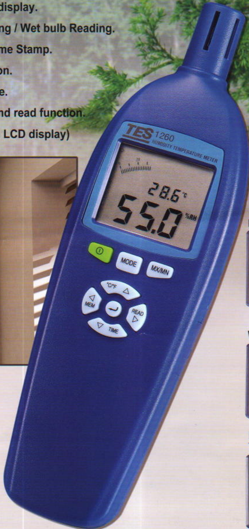
Dew Point Reading